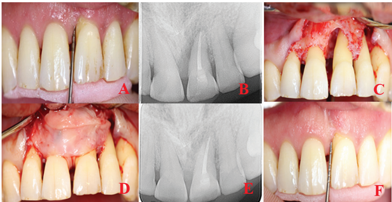
Fig. 1: T-PRF procedure in the treatment of an intrabony defect with endo-perio lesion. A) Preoperative clinical view, B) Baseline radiograph, C) Intraoperative clinical image of typical intrabony defect, D) The defect is filled with the T-PRF membrane, E) Nine months postoperative radiograph, F) Nine months post-operative clinical view.

Blood samples were collected from the antecubital vein of the right or left arm of the patient at the first attempt and drawn into grade IV sterile titanium tubes immediately. The tubes were then centrifuged for 12 minutes at 2800 rpm and room temperature. Following centrifugation, sterile tweezers were used to remove the T-PRF clots from the tubes. Then T-PRF clots were separated from the red blood cell base and left on sterile woven gauze.