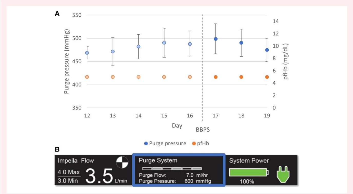
Figure 2 Upper panel: purge pressures (mean ± standard deviation) and evolution of pfHb (measurement once daily). Lower panel: Impella™ console indicating purge pressures within normal range (300–1000 mmHg) during support with BBPS.

concentrations have been evaluated (from 5% to 40%) and, for example, a dextrose purge solution of 20% will result in a 40% reduction in flow rates compared to a 5% solution. <sup>10</sup> In April 2022, the manufacturer obtained FDA approval for the use of BBPS for patients intolerant to UFH (e.g. HIT) or in whom UFH is contraindicated due to bleeding complications. This resulted in a simplification of the anticoagulation management because there was no longer a need to account for fluctuating UFH-doses delivered through the device. <sup>11</sup> In a recent retrospective