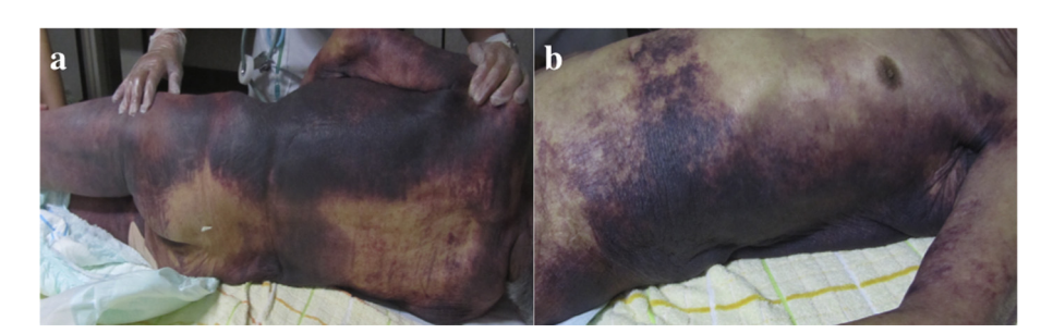
Fig. 2. (a) and (b): Ecchymotic lesions and necrotic purpura on the upper and lower extremities, back, and abdomen.

Several factors have been identified that increase the risk for both myopathy and rhabdomyolysis, including advanced age, CRF, metabolic disorders, major surgery, and alcohol abuse [10–12]. Statins are safe and valuable drugs in patients with renal insufficiency. However, it may be prudent to limit the dose of pravastatin (<20 mg/day) as well as simvastatin (<10 mg/day) in patients with a GFR below 10 mL/min and prior to dialysis [13]. The side effects of statin treatment include gastrointestinal complaints, gallstones, and skin reactions, all of which are tolerable and reversible.