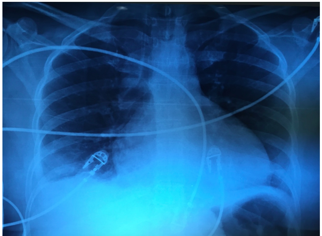
FIGURE 1: Chest X-ray.

Her laboratory tests were: hemoglobin 11.5 g/dL, hematocrit 33.8%, platelet count of 370,000/HPF, leucocytes 12.8/HPF, neutrophils 8.9/HPF, D-dimer 1094 ug/L, creatinine 0.98 mg/dL, glucose 305 mg/dL. Electrocardiogram (ECG) showed sinus tachycardia and low voltage QRS complexes, the chest X-ray revealed pericardial effusion with a characteristic "water bottle sign" (Figure 1), echocardiography reported 400 cc pericardial effusion coupled with right ventricular diastolic dysfunction and a left ventricle intramural hematoma. The CT scan demonstrated a close proximity of the tacks, used on her prior surgery for hiatal mesh fixation, to the inferior surface of the hearth (Figure 2), with pleural and pericardial effusion (Figure 3).