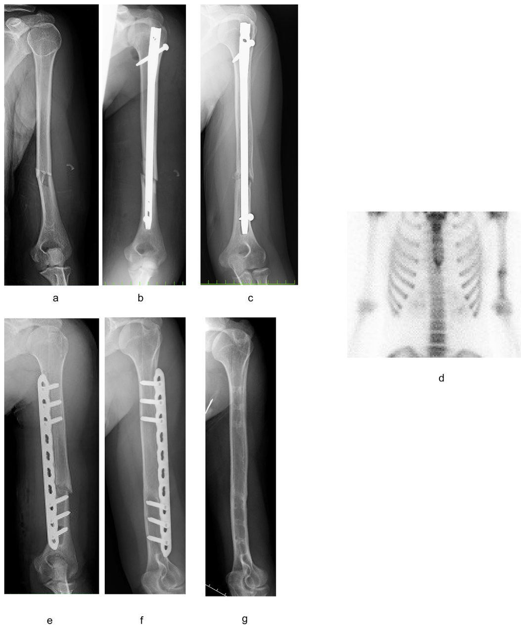
Fig. 1. Views of Case 1. (a) AO classification: 12-B2 fracture. (b) Just after the 1st surgery with IMN. (c) 1 year after the 1st surgery. Little callus formation was observed around nonunion area. (d) Bone scintigraphy showed increased accumulation in the place of nonunion. (e) We performed the reoperation using the MIPO method without autogenous bone grafting. (f) One year after the surgery, bony union was obtained. (g) Final follow-up of 4 years after the surgery.

on the lateral side of the musculocutaneous nerve and medial side of the radial nerve. Another proximal approach passed between the deltoid and the biceps. Subsequently, a narrow locking compression plate (LCP) (DePuy Synthes, West Chester, USA) with 10 holes was slid onto the surface of the humerus from distal to proximal without exposure of the nonunion site. One year after surgery, bony union and good functional recovery was obtained (Fig. 1f), and we removed the implant. At the final follow-up of 4 years after the surgery (Fig. 1g), she had obtained full range of motion with no restrictions in activities of daily life.