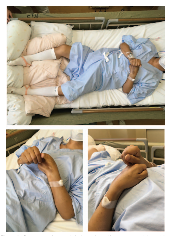
Figure 2. Symptoms of catatonia in the patient with severe motoric immobility. During the patient's clinical course, all 12 psychomotor features (stupor, catalepsy, waxy flexibility, mutism, negativism, posturing, mannerism, stereotypy, agitation, grimacing, echolalia, and echopraxia) in the criteria of the DSM-5 for catatonia were present.