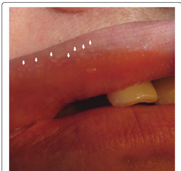
Figure 2 Extraoral photograph. Extraoral photograph image showing Fordyce granules in the upper lip (arrows) of individual III:5 with hereditary nonpolyposis colorectal cancer and colorectal cancer.

Case 3 – A 47-year-old Brazilian man (III:11) presented HNPCC, CRC and an extracolonic associated tumor (hepatic cancer). FGs were found in his upper lip, and the DPRS analysis did not demonstrate dento-osseous anomalies.