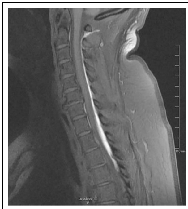
Figure 1. Sagittal MRI image showing gadolinium-enhanced contrast dispersion. Cranial epidural extent was at the level of the posterior arch of C1. Caudal epidural extent was to the T5 inferior endplate, which was better viewed on a subsequent sagittal slice.

Statistical analyses were performed using Excel (Microsoft, Redmond, WA) and SigmaPlot (San Jose, CA). Means and standard deviations (SDs) were determined for each outcome measure.