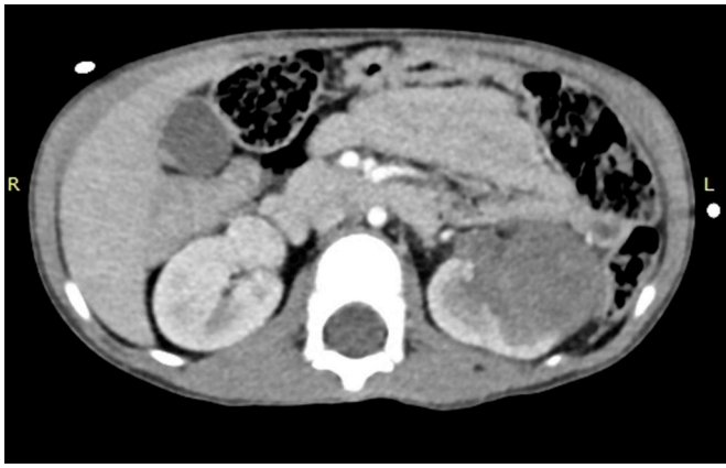
Fig. 1. Right kidney, with normal dimensions. Hypervascularized solid nodule in the anterior cortex of the middle third of the right kidney, measuring 1.8 cm, partially exophytic. Topical left kidney, enlarged, without calculi or hydronephrosis. Infiltrating mass measuring about 6.5 × 3.5 cm, extending from the upper to lower third parenchyma and presenting heterogeneous attenuation.