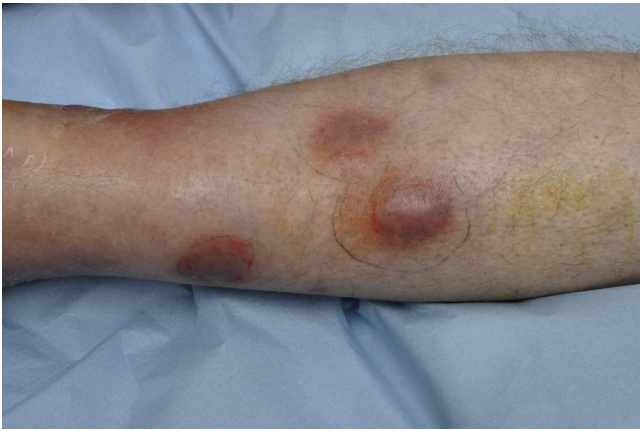
Fig. 1. Left crus with subcutaneous nodules of panniculitis.