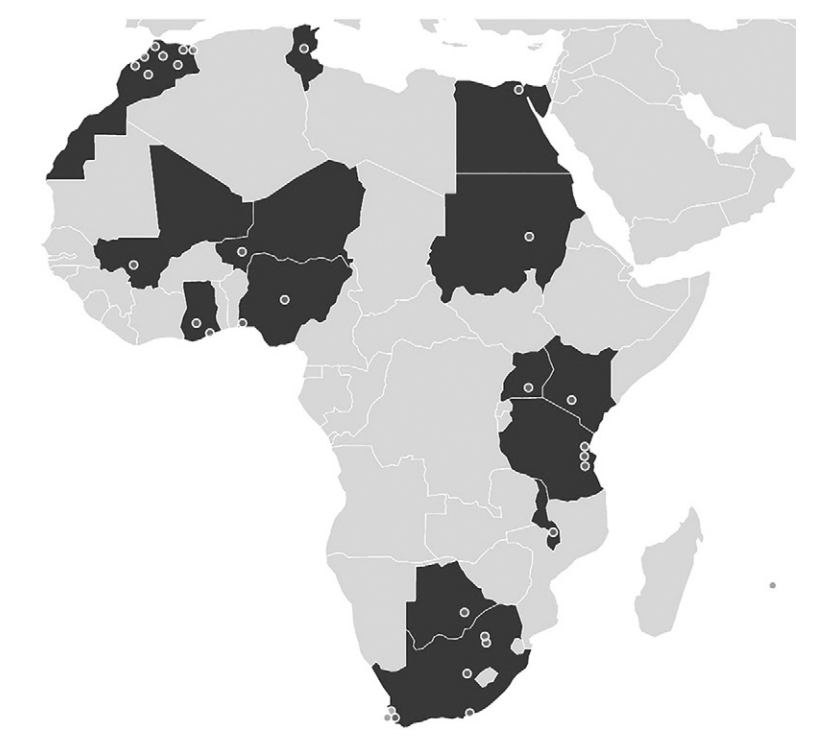
Figure 1. Map of Africa showing the distribution of nodes in the H3ABioNet network. The dot on the right is for Mauritius, and two additional sites not shown include one in the USA and one in the UK.

The mandate of H3ABioNet (http://www.h3abionet.org/) is to develop and roll out a coordinated bioinformatics research infrastructure that is tightly coupled to a sophisticated pan-African bioinformatics training program. In modern genome sequence analysis, analytical tools are moving to where the high dimensional data are stored, so the expertise for genome data manipulation and analysis in Africa are being developed at the source of these data. The network seeks to exploit the development and implementation of best practices in genome bioinformatics in local centers while keeping an eye on the rapidly evolving field through collaboration with centers of expertise in