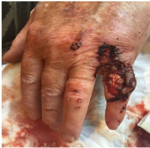
Fig. 1 First appearance on clinical consultation at the emergency department

with an additional soft tissue island extension (Fig. 2a, b). Elevation of this flap started from proximal to distal in a standard fashion. When reaching the most distal perforator of the 3rd web space, we prepared this