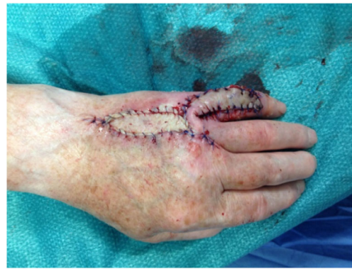
Fig. 3 Immediate postoperative view showing the donor site closure by a full thickness skin graft

perforator with keeping the deep transverse ligament intact. This provided enough pivotal range to mobilize and rotate the flap into the defect. The donor site defect was closed by full thickness skin coverage (Fig. 3), and the wound was treated with cast immobilization for 3 weeks. The patient was satisfied with the result albeit a remaining flexion contracture of about 50 degrees (Fig. 4) resistant to further occupational therapy. After 6 months, range of motion was limited to PIP 0/50/90 and of his DIP joint 0/0/35.