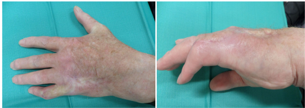
Fig. 4 Postoperative view at 3 months

with the advice to allow for reperfusion prior to inset of the flap [11].