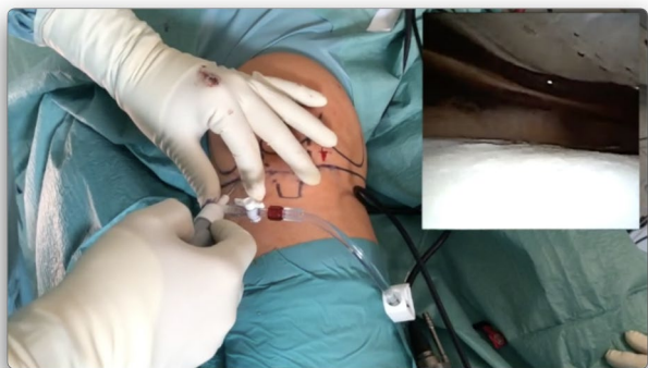
VIDEO 1 Arthroscopy of a right knee with debridement and nanofracturing at the medial femoral condyle.

To view this video please visit https://onlinelibrary.wiley.com/doi/10.1002/ccr3.5590