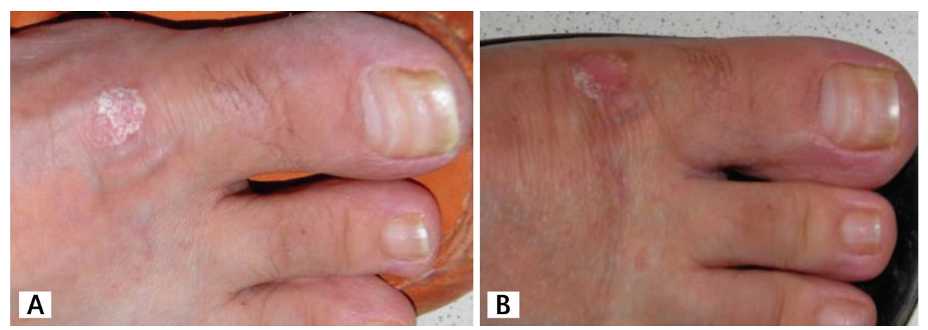
Figure 3. A) Pretreatment photograph showing a light-colored psoriatic lesion on the top of the foot; B) posttreatment photograph showing regression of the psoriatic lesion