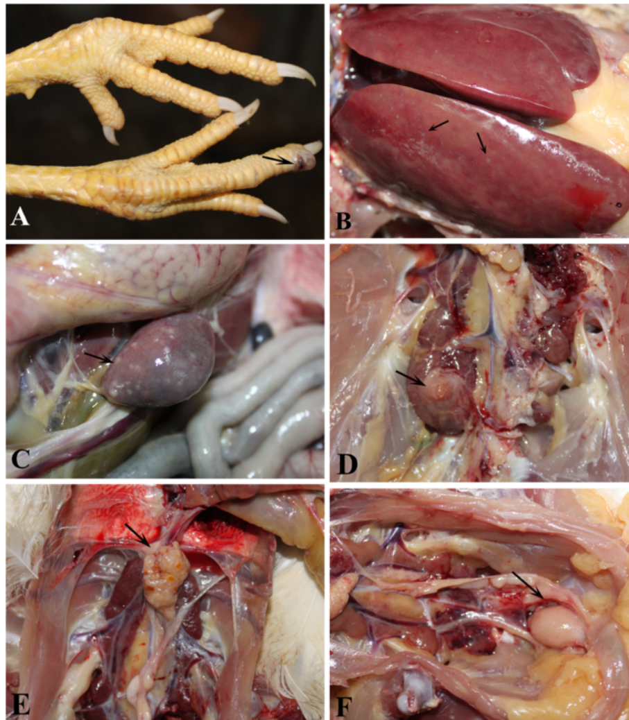
Figure 1 Anatomical lesions induced by SCDY1 in SPF chickens. (A) Hemangioma in the subcutaneous of the feet; (B) Tumour in liver; (C) Tumour in spleen; (D) Tumour in kidney; (E) ovaries had atrophied; (F) bursa had enlarged.

data not shown). For the 10 chicks that survived hatching and the rest of the experimental period, proviral cDNA integration in lymphocytes and virus shedding were detected from the time of hatching (1 day old; Table 3). Of the 10 animals, 6 were positive by PCR, and P27 antigen was constantly detected. Two of the chickens were sometimes positive for the presence of proviral cDNA and P27 antigen, and 2 chickens were always negative for proviral cDNA and P27 antigen. Fertilized eggs ( n = 80 ) were collected from the control group, with 70 of these hatched chickens surviving. PCR and ELISA results for these chickens were negative for the duration of the experiment (data not shown).