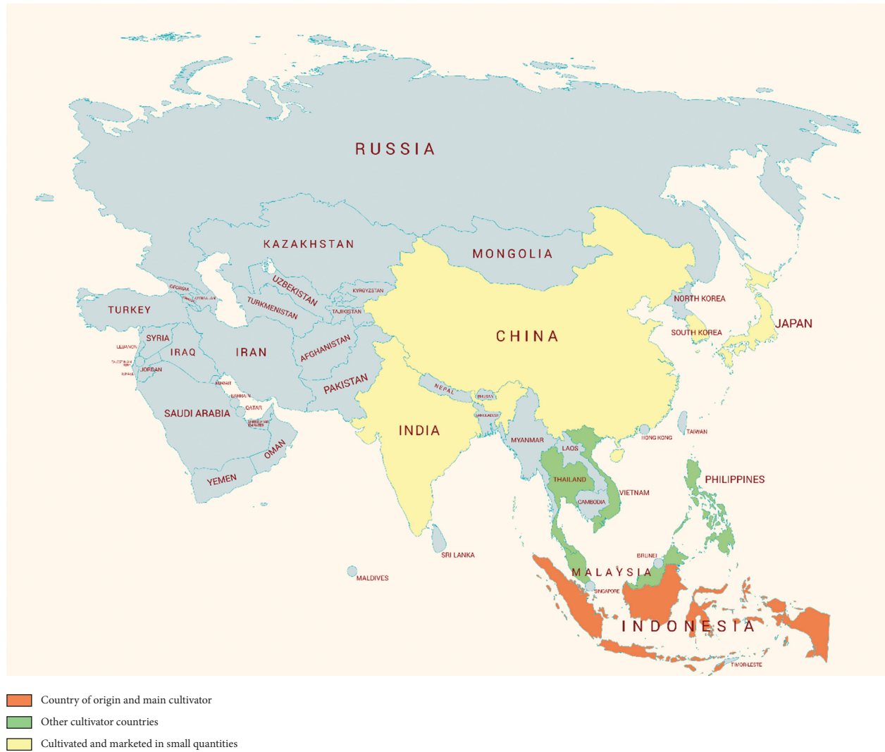
FIGURE 2: Geographic distribution of Curcuma xanthorrhiza Roxb.