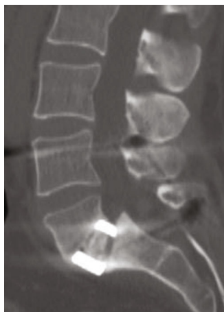
FIGURE 4: One-year CT scan control, highlighting the correct fusion of the L5-S1 level.