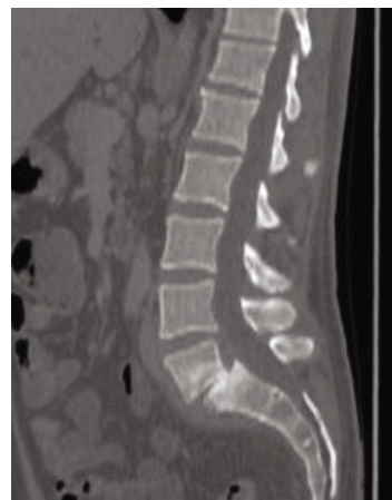
FIGURE 1: The lumbar spine in sagittal sections, highlighting an L5-S1 spondylolisthesis by isthmic lysis.

3.1. A Rare Pathological Entity. Few reports are available about spondylodiscitis on previous isthmic spondylolisthesis, and none of them described surgical procedure. Tanaka et al. [9] mentioned the case of a 35-year-old orthopedic surgeon experiencing an L4-L5 spondylodiscitis, while this patient was already conservatively treated for a radiologically documented L4-L5 isthmic spondylolisthesis inducing chronic low back pain. Following medical treatment including culture-specific antibiotics and lumbar bracing, favorable outcome was achieved. Guglielmino et al. [10] related the only other adult case about a brucellar spondylodiscitis, with retroperitoneal muscle abscess surgically drained, but with-