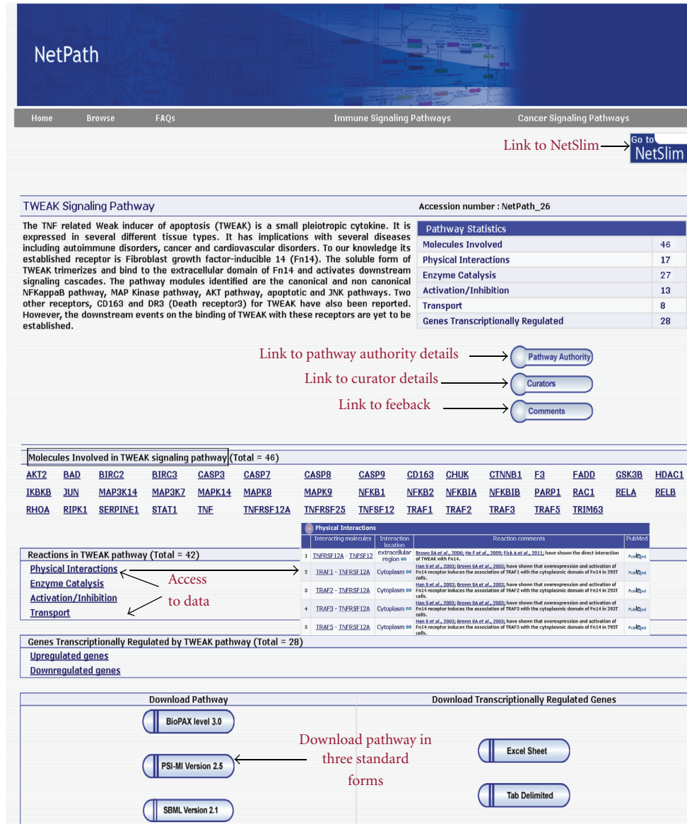
FIGURE 2: Illustration of the TWEAK page in NetPath. The image provides an outline of the TWEAK pathway as visualized in the NetPath webpage. The figure shows the statistical details of TWEAK pathway-based reactions (right upper corner). Under, “Molecules involved in TWEAK signaling pathway”, each molecule has been linked to its respective NetPath page. Tabs have been provided which leads to the details of the “pathway authority,” “curators,” and “comments” tab—where the users can provide their feedback and the reaction tabs. “Access to data” indicates links to the events regulated by TWEAK. The pathway can be downloaded from the three standard formats provided at the bottom of the page.

3.3. Data Availability and Reactions. The TWEAK data in NetPath are available freely and can be used by the scientific community. The data are represented in various standard exchange formats that include Biological Pathway eXchange (BioPAX) [73], Systems Biology Markup Language (SBML) [74] and Proteomics Standards Initiative Molecular Interaction (PSI-MI) [75] language formats. The PSI-MI is a community standard language for molecular interaction data used for data comparison and exchange. However, SBML is a machine readable format for representing biological models. BioPAX is another standard language that has features compatible with SBML and PSI-MI formats. The