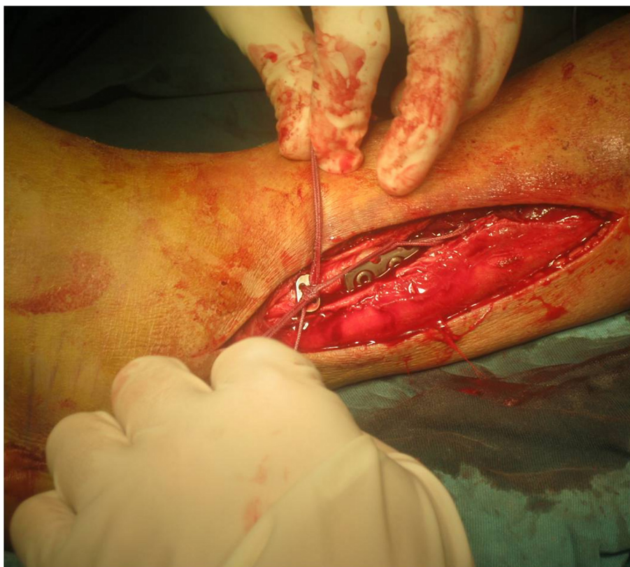
Figure 5 The nut was tightened.

strands with each having at least 3 half-hitches (Figure 6). The bolt was fastened gradually by the nut until the second pre-cut groove was exposed when anatomical reduction of the syndesmosis could be achieved.