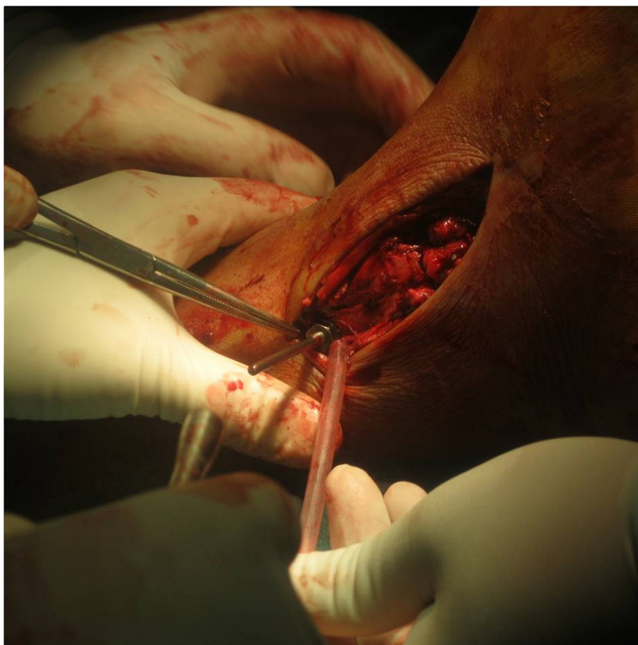
Figure 6 Knots were making after the nail was pulled to the proper position.

The patients were followed up. The clinical and radiological evaluations (Figure 7) at 12-month are summarized in Table 2. All patients were satisfied with the outcomes. The hardware was routinely removed at 12-month follow-up. All patients were followed up for an average of 13.8 months (range, 12 to 17 months) after hardware removal (Table 2). At the latest follow-up, the mean AOFAS score was 96.3, without significant difference with those assessed at 12-month after fixation operations; the mean MHS and PHS were 57 and 50.3, respectively, without significant difference with those assessed at 12-month after fixation operations. No syndesmotomic diastasis reoccurred (Figure 8). The mean value of MCS, TFOL and TFCS was 3.2 mm, 8.4 mm and 4.1 mm, respectively (Table 2). There were no significant differences between MCS, TFOL and TFCS at 12-month follow-up and those assessed at the latest follow-up, respectively (all P > 0.05 ).