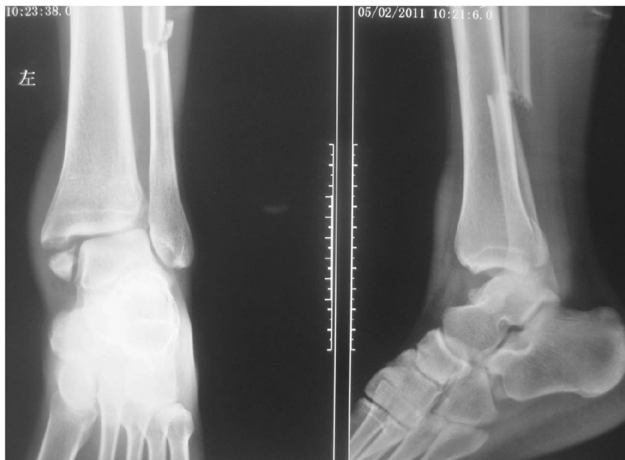
Figure 2 The pre-operation radiograph shows that the fracture type was 44C23 by AO classification combined with distal tibiofibular diastasis.

physical exercises earlier. Tightrope gets its popularization in treating syndesmotic diastasis. However, tightrope may become loose and syndesmotic diastasis may re-occur in a long term [19]. In addition, it lacks the ability of reducing syndesmotic diastasis [20,21]. Therefore, we designed the assembled bolt-tightrope system (ABTS) to combine the advantages of both the syndesmotic bolt and tightrope. We hypothesized that ABTS can effectively reduce the syndesmotic diastasis and also provide flexible fixation. The purpose of this study was to evaluate the primary clinical and radiographic outcomes of syndesmotic diastasis treated with ABTS.