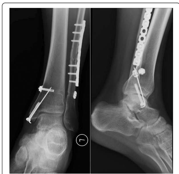
Figure 7 Mortise and lateral view of the ankle joint radiograph showed union of the fibular and medial malleolus fractures and a normal syndesmosis at 1 year follow-up after operation.

MCS medial clear space, TFCS tibiofibular clear space, TFOL tibiofibular overlap, AOFAS American Orthopedic Foot and Ankle Society, SF-12 Short Form-12 Health Survey questionnaire, MHS mental health summary, PHS physical health summary.