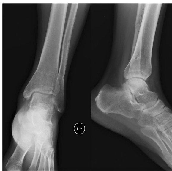
Figure 8 The photograph was taken at 2 weeks after hardware removal operation when patient returned to normal walking. This photograph showed that all hardware were removed and no syndesmotism reoccurred.

according to SF-12 questionnaire. The AOFAS score was 96.3 on average, which was similar to that of patients treated with tightrope reported by Coetzee J and DeGroot H [16,21], and was higher than that of patients treated with syndesmotism bolt and standard screw fixation [6,14,17,21,25,26]. Excellent functional recoveries of the affected ankle joints were achieved in all patients, which should be mainly attribute to flexible fixation of the syndesmosis, the early weight-bearing exercise and long-term maintenance of the reduction of distal tibiofibular joint.