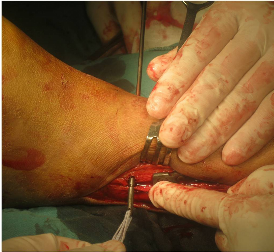
Figure 4 The tunnel had been created and the device was pulling from lateral to medial by hand.

used. The associated fractures were firstly managed using AO technique (Figures 2 and 3). Some diastasis of the syndesmosis could be reduced spontaneously after open reduction and internal fixation of the ankle fractures. However, some diastasis remained after the management of ankle fractures, which should be reduced firstly with a reduction clamp or using ABTS itself.