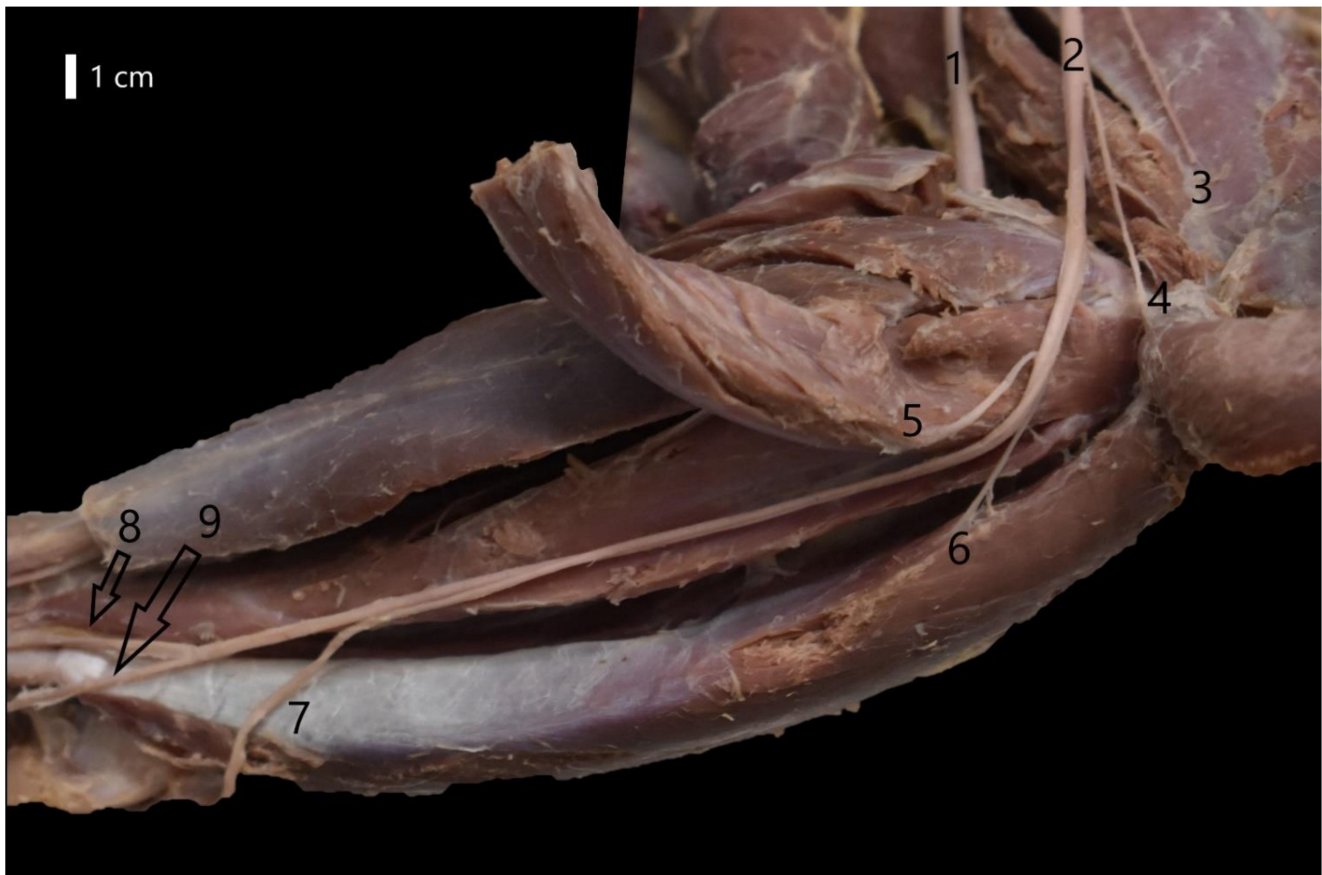
Figure 4. Course of the ulnar nerve at the forearm level in the European badger ( Meles meles ). 1—Median nerve; 2—Ulnar nerve; 3—Part of the caudal antebrachial cutaneous nerve; 4—Branch of the ulnar nerve to ulnar head of the flexor carpi ulnaris muscle; 5—Branch of the ulnar nerve to humeral head of the flexor digitorum profundus muscle; 6—Branch of the ulnar nerve to humeral head of the flexor carpi ulnaris muscle; 7—Dorsal branch of the ulnar nerve; 8—Superficial branch of the palmar branch of the ulnar nerve; 9—Deep branch of the palmar branch of the ulnar nerve.