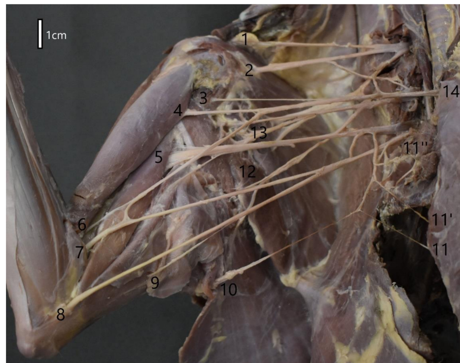
Figure 2. Structure of the right brachial plexus of the red fox ( Vulpes vulpes ). 1—Brachiocephalic nerve; 2—Suprascapular nerve; 3—Branch of the musculocutaneous nerve to coracobrachialis muscle; 4—Branch of the musculocutaneous nerve to biceps muscle of the arm; 5—Radial nerve; 6—Musculocutaneous nerve; 7—Medial nerve; 8—Ulnar nerve; 9—Part of the caudal antebrachial cutaneous nerve; 10—Lateral thoracic nerve; 11,11',11''—Caudal pectoral nerves; 12—Thoracodorsal nerve; 13—Axillary nerve; 14—Cranial pectoral nerve.