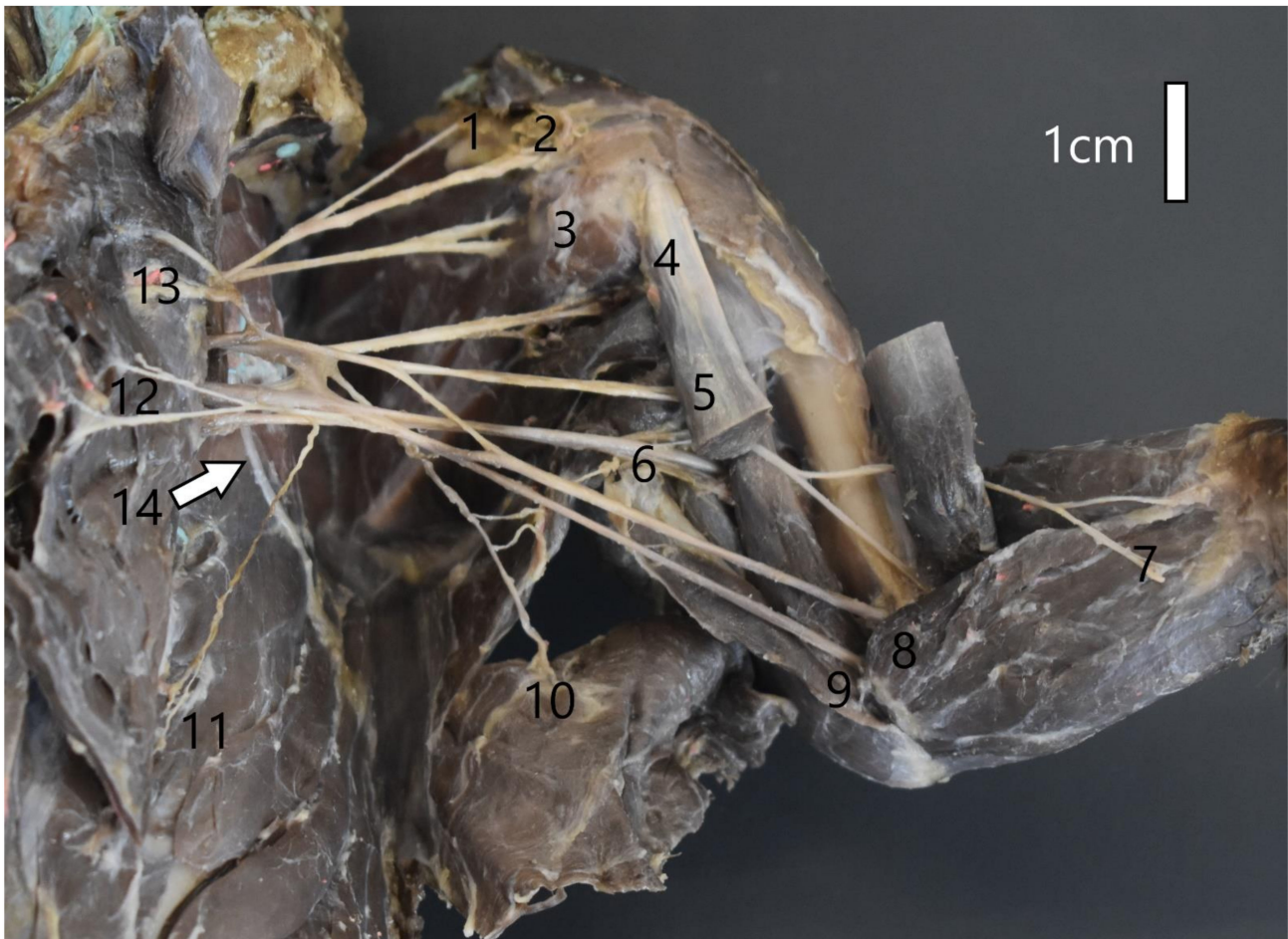
Figure 3. Structure of the left brachial plexus of the American mink ( Mustela vison ). 1—Brachiocephalic nerve; 2—Suprascapular nerve; 3,—Subscapular nerve; 4—Axillar nerve; 5—Musculocutaneous nerve; 6—Radial nerve; 7—Medial antebrachial cutaneous nerve; 8—Median nerve; 9—Ulnar nerve; 10—Thoracodorsal nerve; 11—Lateral thoracic nerve; 12—Caudal pectoral nerve; 13—Cranial pectoral nerve; 14—Long thoracic nerve.

The ulnar nerve branched into a cutaneous ramus, i.e., the caudal antebrachial cutaneous nerve ( n. cutaneus antebrachii caudalis ) and articular branches. Then it went towards the ulnar process and passed near the medial epicondyle. At the forearm level, together with the median nerve, it innervated the medial abdominal muscles. Before the wrist, it branched into the dorsal ramus, which innervated digit V (Figure 4). At the wrist level, it divided into the superficial branch and the deep branch. The deep branch ran towards the metacarpal bones, whereas the superficial branch ran towards the distal ends of the digits, forming the common palmar nerves. At the level of the digits, the proper palmar digital nerves IV and V and the abaxial digital nerve V were formed. The course of the ulnar nerve was consistent with this pattern in all the species.