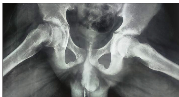
Figure 3. Plain radiograph taken in frog leg position showing a widening of the right proximal physis below the right femoral head with a medial and posterior slip of the right femoral head.