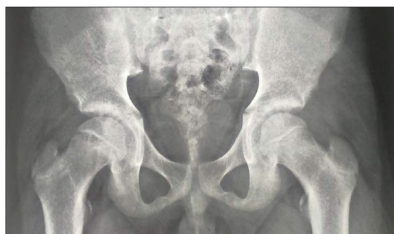
Figure 4. Frontal radiograph of the pelvis taken six months before showing a widening of the proximal right femoral physis.

significant past medical history. Routine laboratory investigations were normal. The patient was referred to the Department of Radio-diagnosis for ultrasound. Ultrasound of both hips was performed with a high frequency transducer (5–9 MHz). A posterior displacement of the femoral head epiphysis with a physeal step was seen on the longitudinal section obtained over the right hip joint region. The anterior physeal step (APS) measured ~3.8 mm on the right side (Figure 1). There was no anterior physeal step on the left side. The distance between the anterior rim of the acetabulum and the metaphysis measured ~20.4 mm on the