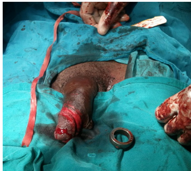
Fig. 3. Post op photo of the penile ring alongside a healthy looking penis.

Patient was released to the ward later complaining of mild hypoesthesia of the glans and lack of morning erections. No areas of