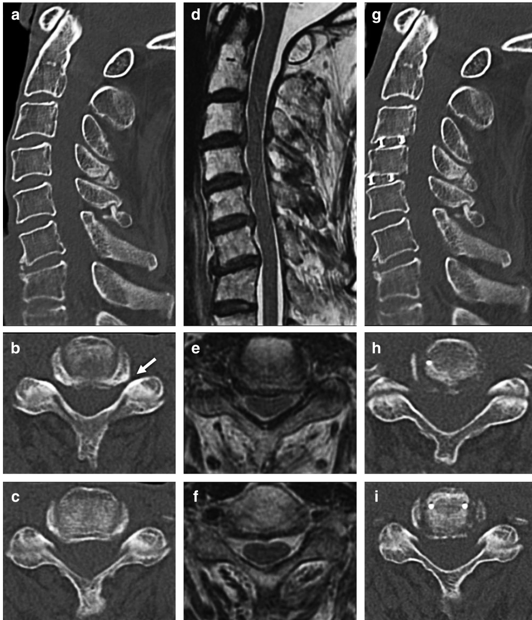
Fig. 2 Preoperative and postoperative findings. Preoperatively, a remarkable spinal canal stenosis did not exist in the sagittal view of cervical CT (a), whereas foraminal stenoses were observed at C3/4 (b), C4/5 (c), and C5/6 on both sides in the axial view. The C3/4 foramen on the left side was especially narrow (white arrow). Cervical MRI revealed mild disc bulging at C3/4, C4/5, and C5/6 in the sagittal view (d) without an intramedullary high signal on T2-weighted images. It also showed no lateral disc herniations at C3/4 (e), C4/5 (f), and C5/6 in the axial view. Postoperatively, titanium-coated PEEK cages were inserted between C3/4 and C4/5 (g). Intervertebral foramina were expanded at C3/4 (h) and C4/5 (i). CT: computed tomography, MRI: magnetic resonance imaging, PEEK: polyether-ether-ketone.

To our best knowledge, only 10 cases of phrenic nerve palsy associated with cervical spondylotic radiculopathy exist, including the present case 2-10 (Table 1), with nearly the same number of case reports associated with cervical myelopathy, 11-19