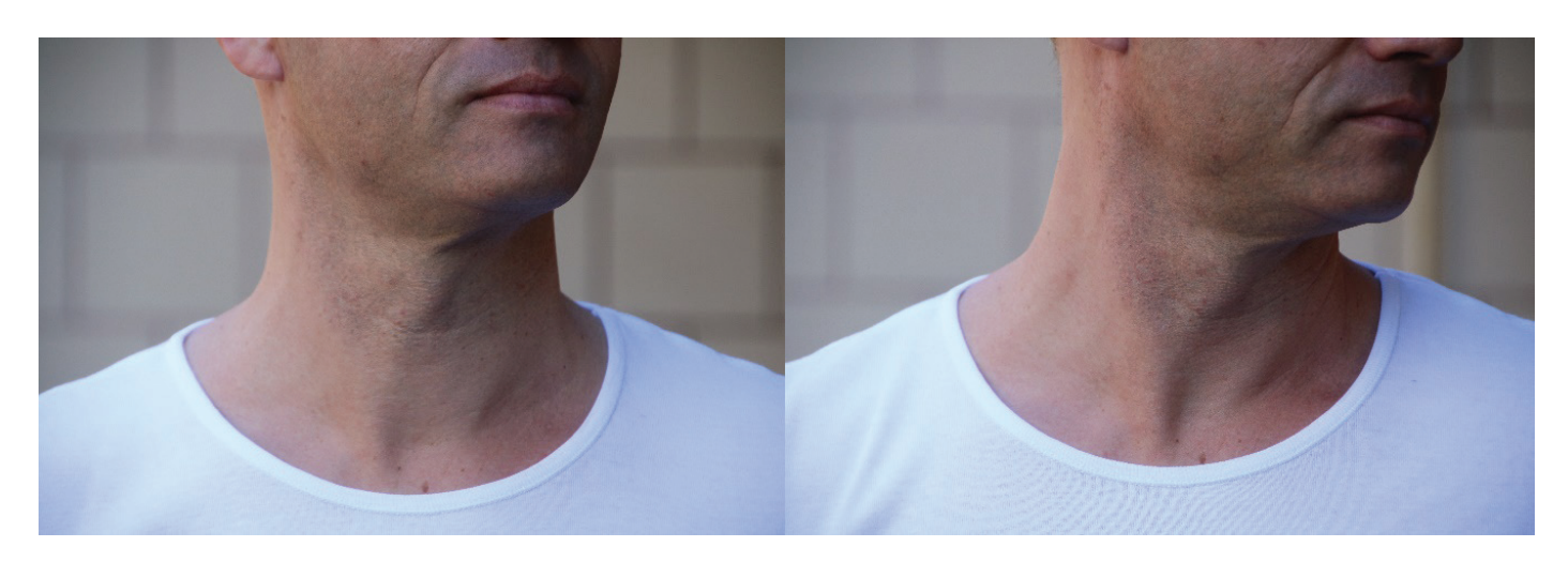
Figure 2. Torticaput vs. Toricollis. In Cases of Torticaput (on the Left), the Larynx Remains Rather More in a Medial Position, and in Torticollis (on the Right) it Rotates Laterally.

The results of the underlying study show, first, that the traditional way of treating torticollis does work, which is not surprising in as much as it confirms our clinical experience.<sup>5</sup> They show, second, that interestingly the modification induces an improved effect, thus supporting a differentiated, flexible approach. It must be admitted that pure cases of torticaput are rare<sup>1</sup> and typically involve combinations.