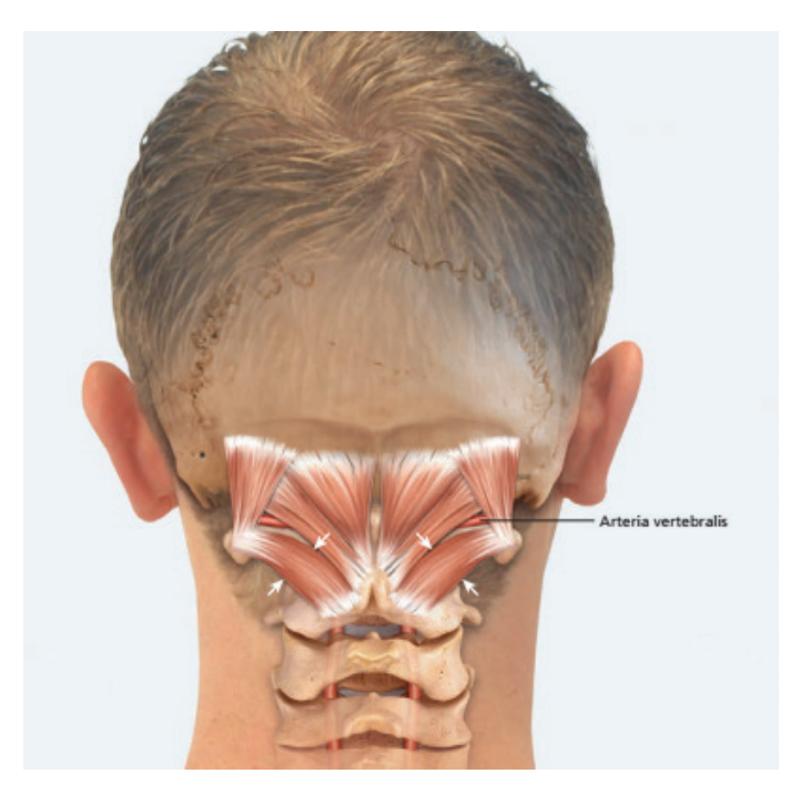
Figure 1. Anatomy of short neck muscles. Short Neck Muscles with Marked Obliquus Capitis Inferior Muscle<sup>3</sup> (with Permission of the Author and Publisher).

During the study period, a total of 22 patients (13 women and 9 men, mean age 58.7 \pm 11.85 years) with a typical torticaput (without any further subtype) were examined and treated (Table 1). Almost all subjects benefited from the injection, according to both the standard treatment