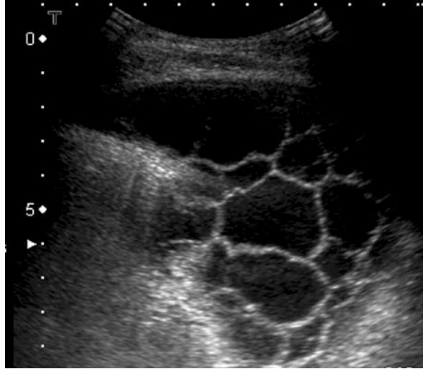
Image 3 Bedside lung ultrasonography