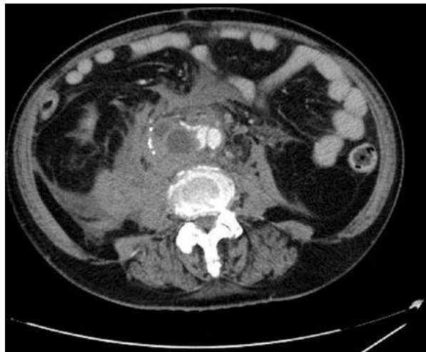
Image 1 CT scan of the abdomen