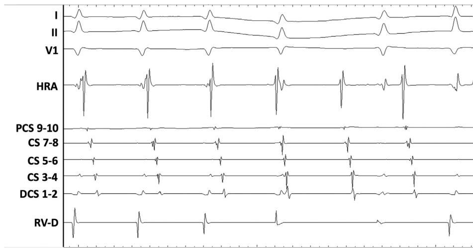
Figure 1 Atrial tachycardia. Intracardiac electrograms during atrial tachycardia revealed atrial and ventricular dissociation. Atrial activation was concentric with cranial-to-caudal activation. CS = coronary sinus; DCS = distal coronary sinus; HRA = high right atrium; PCS = proximal coronary sinus; RV-D = right ventricle distal.

advanced PN management was employed by utilizing diaphragmatic CMAP monitoring.