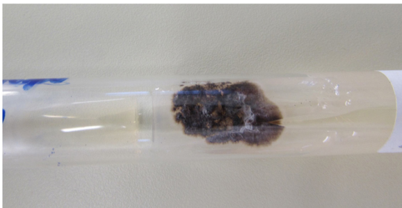
Figure 3 Fungal culture at 25 °C showing a blackish filamentous colony with whitish areas. Colony growth after seven days.

In Brazil, sporotrichosis has been an emerging zoonosis for the last 20 years. With the advent of molecular biology techniques, it has been shown that the classic agent Sporothrix spp. consists of a group of species among which S. brasiliensis , S. schenckii , S. globosa , and S. luriei stand out as human pathogens. 3 With the epidemic of zoonotic sporotrichosis, clinical forms hitherto uncommon are being described, such as hypersensitivity reactions, 4-6 which can present as erythema multiforme, Sweet's syndrome, or ery-