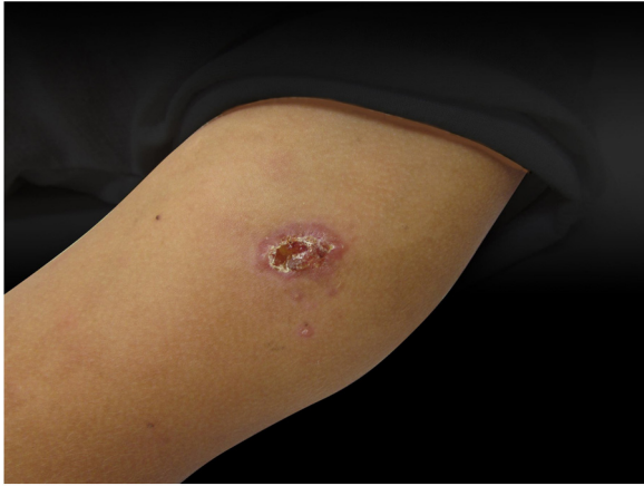
Figure 1 Dermatitis located in the upper portion of the left arm, characterized by an erythematous ulcer with well-defined edges and a granular bottom measuring approximately 1.5 cm in diameter.