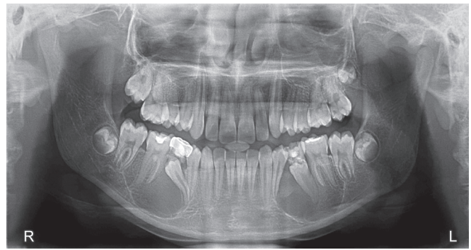
Fig. 2 : Panoramic radiograph shows bilateral well-defined radiolucencies associated with 35 and 45 and extending from 34 to 37 and 44 to 47, respectively

right side was approximately 38.0 \times 28.7 \times 19.4 mm encroaching the inferior border of the mandible (Fig. 3B). Furthermore, the systemic evaluation of the patient for syndromic features, such as malocclusion, condylar defects, gingival hyperplasia, and maxillary micrognathia, was confirmed negative. Hence, based