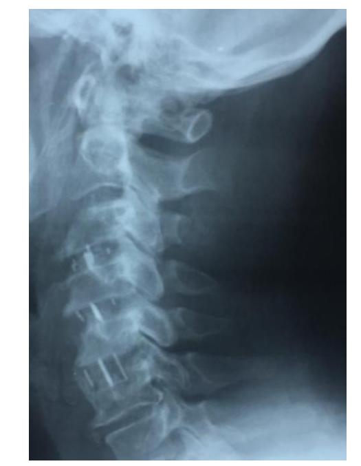
Figure 4: A case ACDF with the insertion of C3-4, C4-5, and C5-6 showing good fusion

A case ACDF with the insertion of C3-4, C4-5, and C5-6 showing good fusion is shown in Fig. 4.