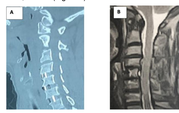
Figure 3: A) Postoperative C.T scan of the cervical spine of a patient complaining of axial pain after doing ACDF with the insertion of C4-5, C5-6, and C6-7 cages; B) MRI cervical spine of the same patient showing adjacent segment failure at the level of C3-4

Adjacent segment failure has been noted in 8 cases,11.76% (Figure 3).