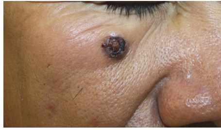
FIGURE 1: Clinical image of lesion. A purple nodule, located on the right cheek, with a diameter of 1.5 cm and an ulcerated center and surrounded by hematic crust having slightly raised edges and a firm consistency.