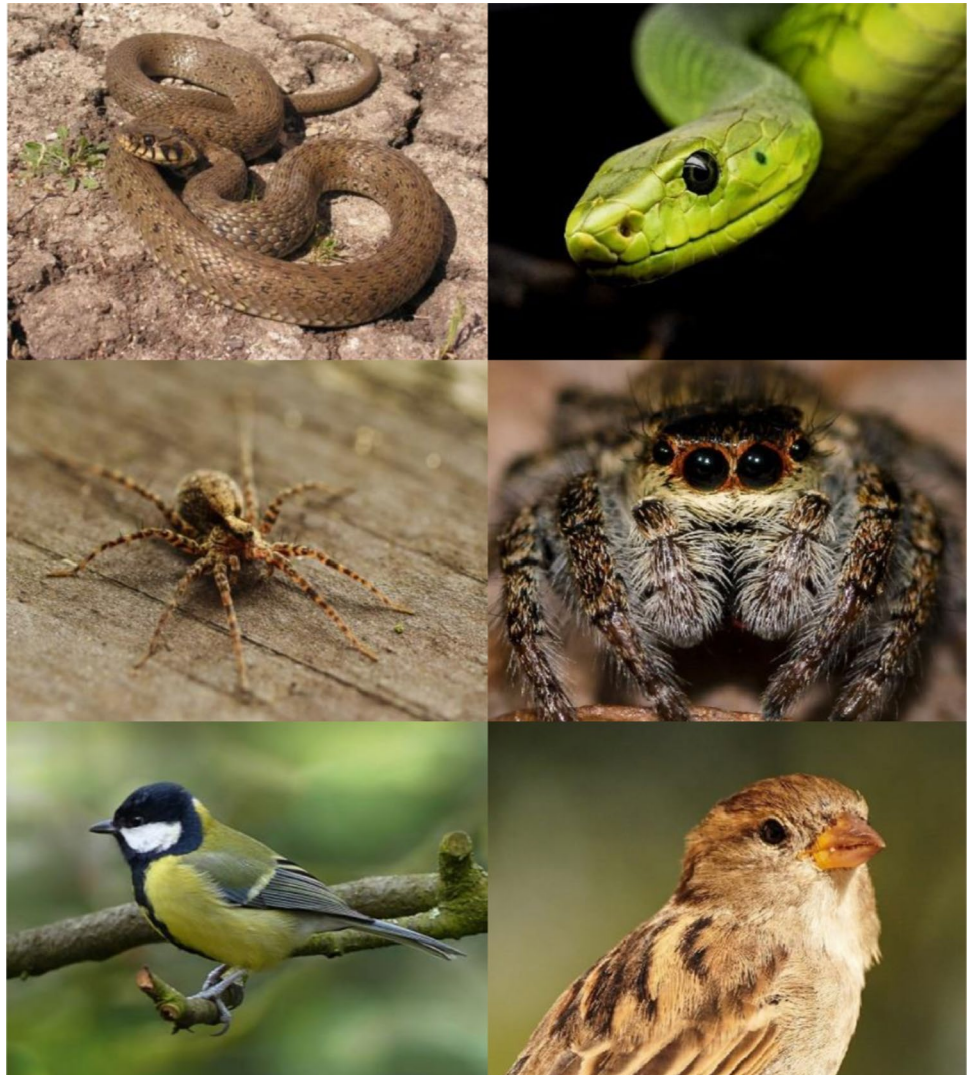
Fig. 1 Examples of medium-shot (left column) and close-up (right column) snake, spider and bird pictures. For copyright reasons, the depicted photographs are public domain; they are similar to the actual stimuli, but were not used in the experiment

A BioSemi Active-Two system was used to record brain activity during the RSVP task. The system used 32 pin type active Ag/AgCL electrodes on an elastic cap, following the rules of the international 10–20 system. Flat type active electrodes were used to record the Electro-ocular activity (EOG). For this purpose, two electrodes were placed above and below the left eye and another set of two electrodes on the outer corners of both eyes. Both EEG and EOG data were registered with a sampling rate of 512 Hz, 134 Hz low-pass filtering and 24-bit A/D conversion.