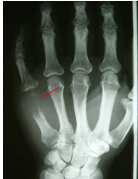
Figure 2 Destruction of the distal part of the 5 th metacarpal.

The exact reason for this rarity of such metastases is not known. In 1889 Paget [9] suggested the "seed and soil" theory for metastasis, which states that one needs to have both seed (i.e. tumor emboli) and good soil (or proper site) for this tumor emboli to settle down and grow. Pros-