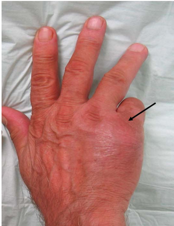
Figure 1 The swelling at the dorsal part of the hand over the 5 th metacarpal.

The most common site of metastatic deposits to the hand is the distal phalanx. The incidence of metastasis to the metacarpals is 17%, phalanges 66% and carpal bones 17% [7]. Keramidias and Brotherston [8] published a case with metastasis to both metacarpal and carpal bones, which is extremely rare.