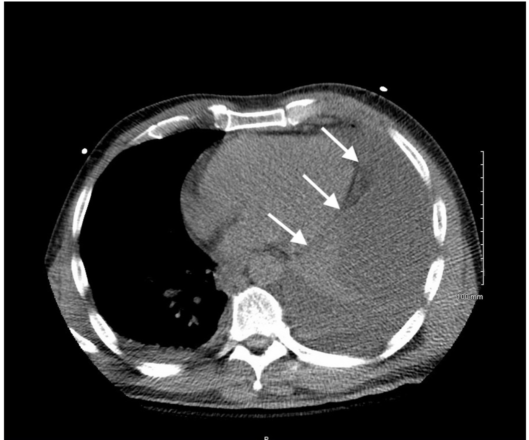
FIGURE 1: Axial image from non-contrast CT of the chest showing a large, loculated, left-sided pleural effusion bordering the posterolateral margin of the heart (arrows).

tomography (CT) scan revealed a small, left-sided pleural effusion. After appearing stable on medical observation, the patient was discharged after one day with pain medication for his symptoms. Three days later, the patient again presented to the ED with worsening dyspnea, confusion, and continuing left-sided hip pain. Physical examination was positive for confusion and unequal pupils. The patient denied any subjective fevers, but stated that he had experienced sweats prior to admission. Objectively, the patient's vital signs showed an oxygen saturation of 86% on room air, though his respiratory rate and temperature were within normal limits at the time. A large, loculated, left-sided pleural effusion was revealed on non-contrast CT of the chest (Figure 1).