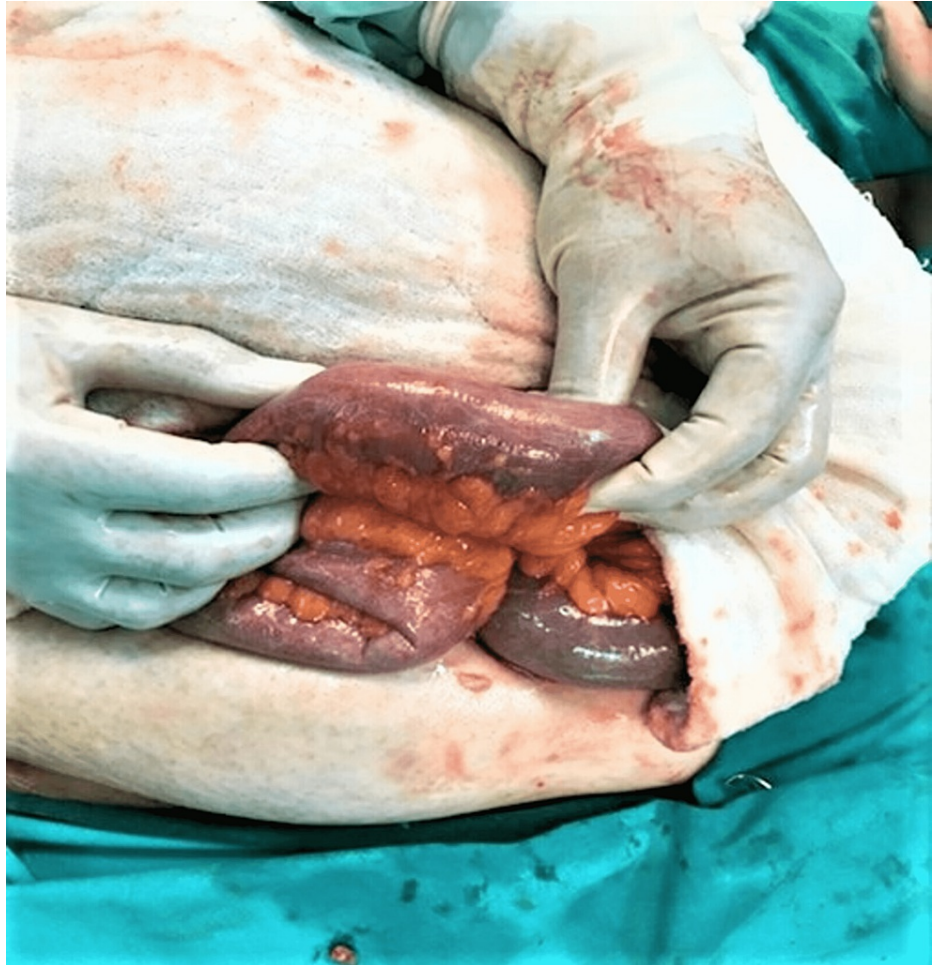
FIGURE 1: The phytobezoar is seen completely obstructing the small bowel lumen