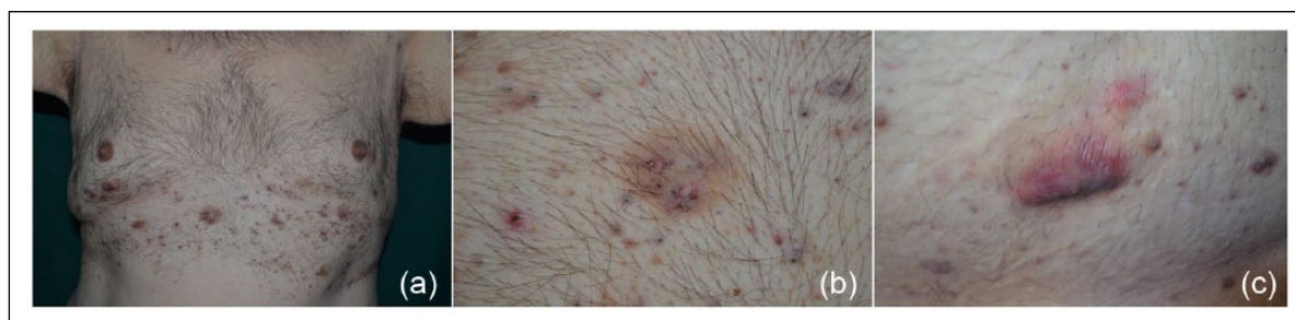
Figure 1. Diffuse involvement of trunk (a) with many closed comedones (b) and inflamed nodules with purulent discharge (c).

treatment. More rarely, sorafenib may target hair follicles. 2 When severe or protracted, skin toxicity can result in significant morbidity, requiring dose modification or drug discontinuation, with consequent dramatic impact on patients' prognosis. Management of cutaneous AEs may be a real challenge because of the limited therapeutic options in patients with impaired liver function, who are often also affected by multiple comorbidities.