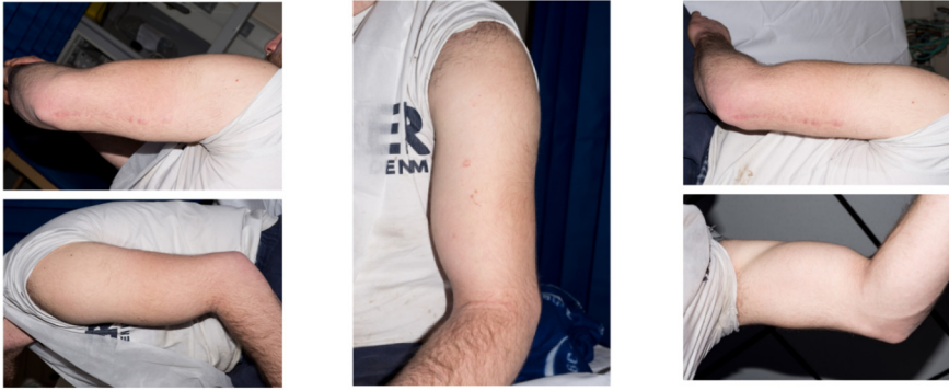
Fig. A. Medical Photography: injury to left upper limb.