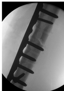
Fig. D. Radiograph: image intensifier - ORIF.