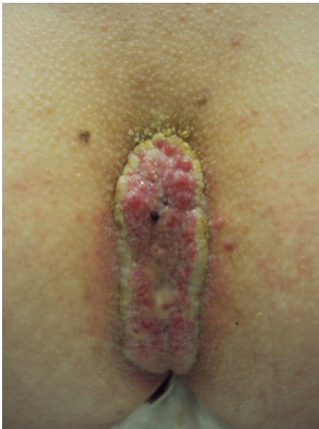
FIGURE 6: Perianal plaque.