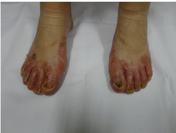
FIGURE 2: Erythema and fissured fingers.