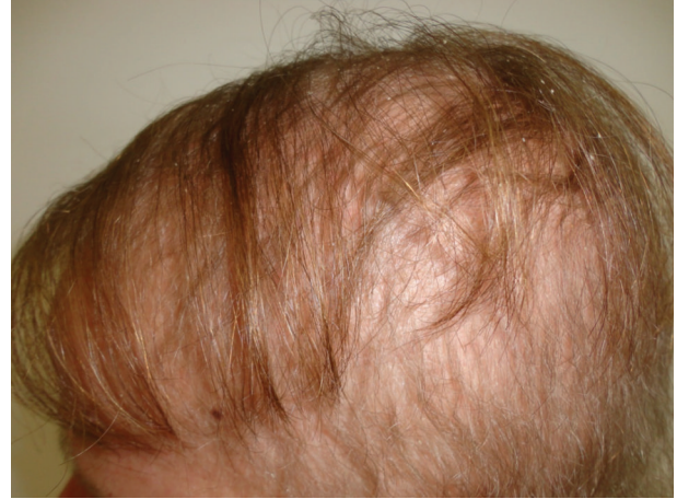
FIGURE 3: Diffuse alopecia.