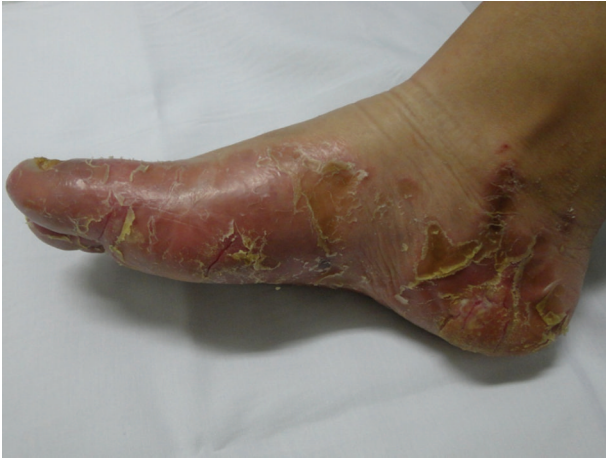
FIGURE 1: Plantar keratoderma.