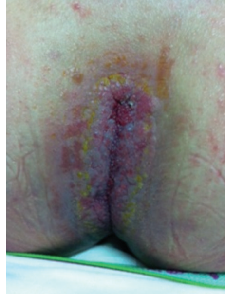
FIGURE 8: Improvement of perianal hyperkeratotic plaque after treatment.