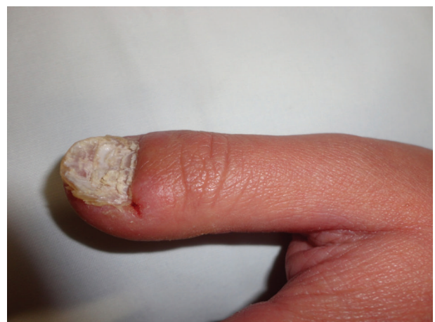
FIGURE 4: Nail dystrophy.

Cytokeratins have been identified as abnormal in the skin affected by keratoderma that consisted of staining involving the entire thickness of the epidermis with cytokeratin AE1 (normally this cytokeratin only stains the basal layer of the epidermis). Normally cytokeratin 10 is confined to the suprabasal layers whereas this cytokeratin 10 stained only the upper layer of the epidermis in hyperkeratotic lesions of Olmsted syndrome. Some studies showed that expressions of cytokeratins 5 and 14 were abnormally increased similar to those of hyperproliferative disorders. These cytokeratin abnormalities may indicate that the skin involved in Olmsted syndrome retains an immature proliferative profile. Immunohistochemical studies with Ki-67 marker demonstrated that hyperproliferative activity involves the basal and suprabasal keratinocytes in Olmsted syndrome [1, 4].