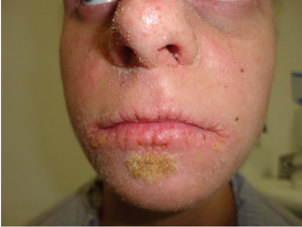
FIGURE 5: Hyperkeratotic plaque on chin, perioral fissures.