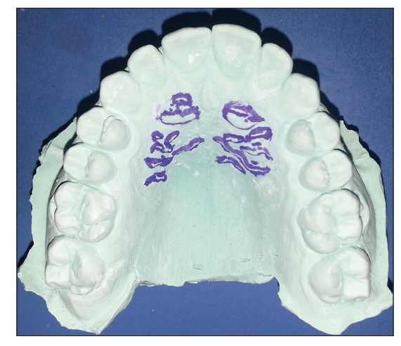
Figure 2: Cast shwoing the tracing of pattern of palatine rugae

The total number of rugae and the mean value for males and females is illustrated in Table 1. The distribution of different types of rugae in males and females were statistically analyzed and illustrated in Table 2. There was a statistically significant difference in the converge pattern of rugae which was found to be higher among females than males (P < 0.05). There was also a statistically significant difference in the circular pattern of rugae which was higher in males than females (P < 0.05). Distribution of the length of rugae was noted and statistically