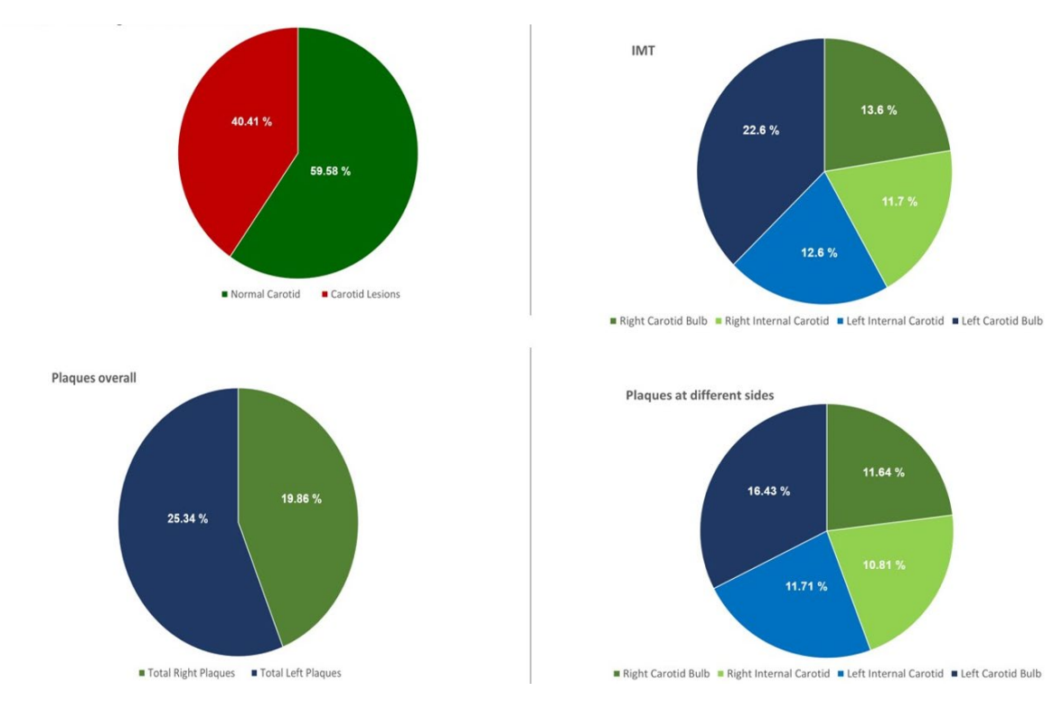
Figure 1. Percentage of Carotid lesions overall.