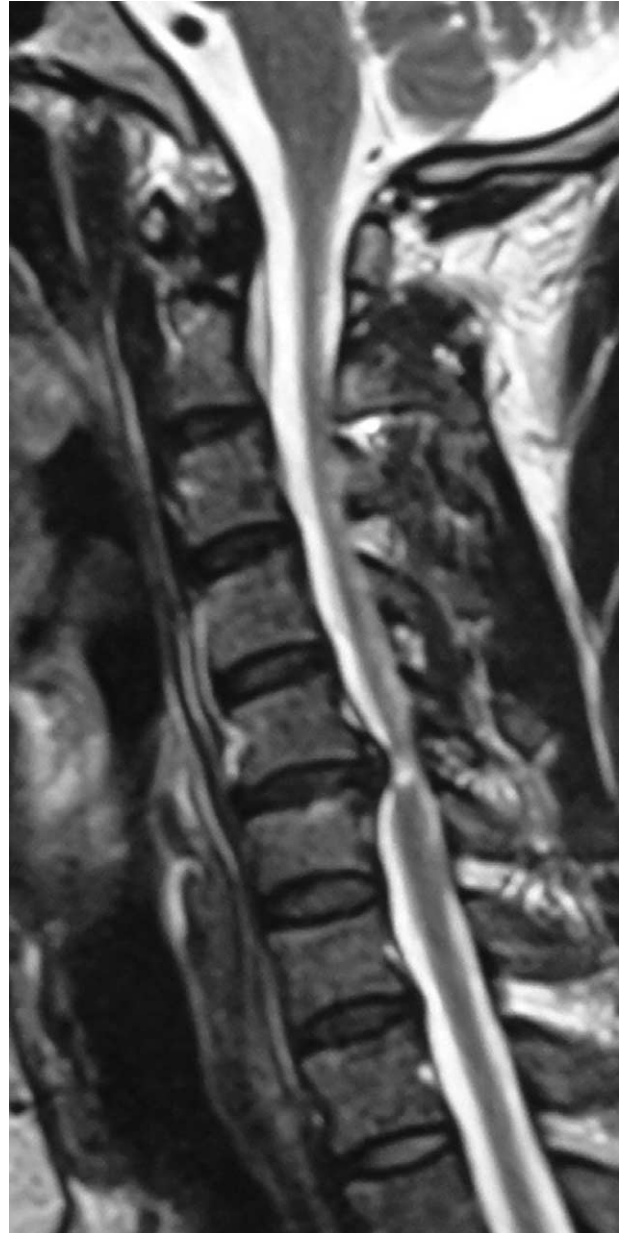
FIGURE 2. T2-weighted sagittal magnetic resonance imaging (MRI) revealed a large herniation of C5/6 disc before operation, with marked compression of cervical cord, resulting in myelomalacia.

Case 1 has undergone a follow-up of 12 months. Her cervical vertigo never recurred, and her blood pressure remained normal without the use of antihypertensive medications. Case 2 has