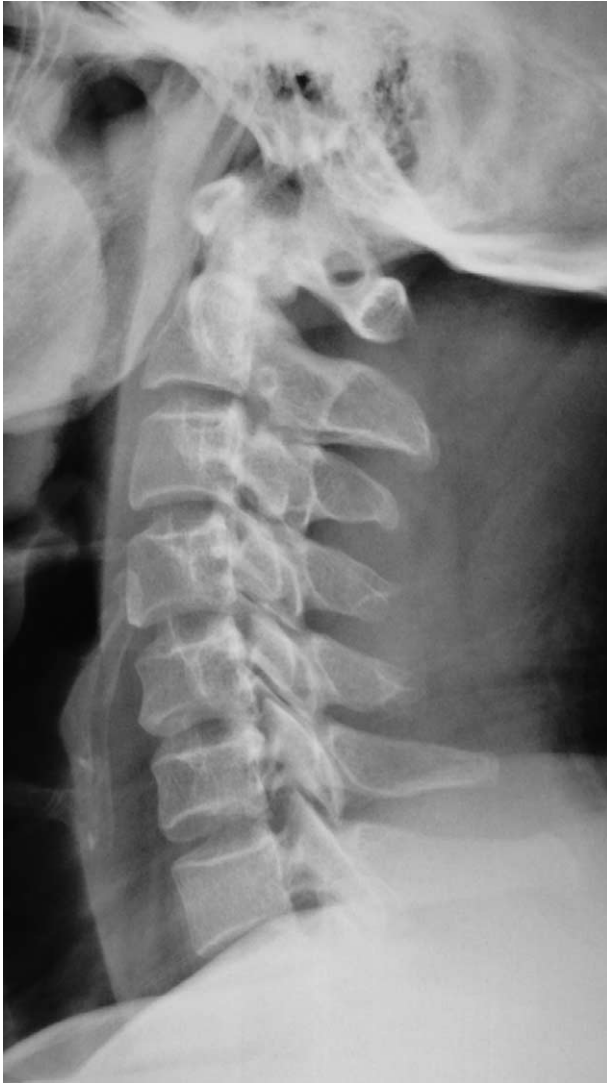
FIGURE 1. Lateral radiograph of cervical spine before operation showed slight narrowing of the C5/6 disc space.