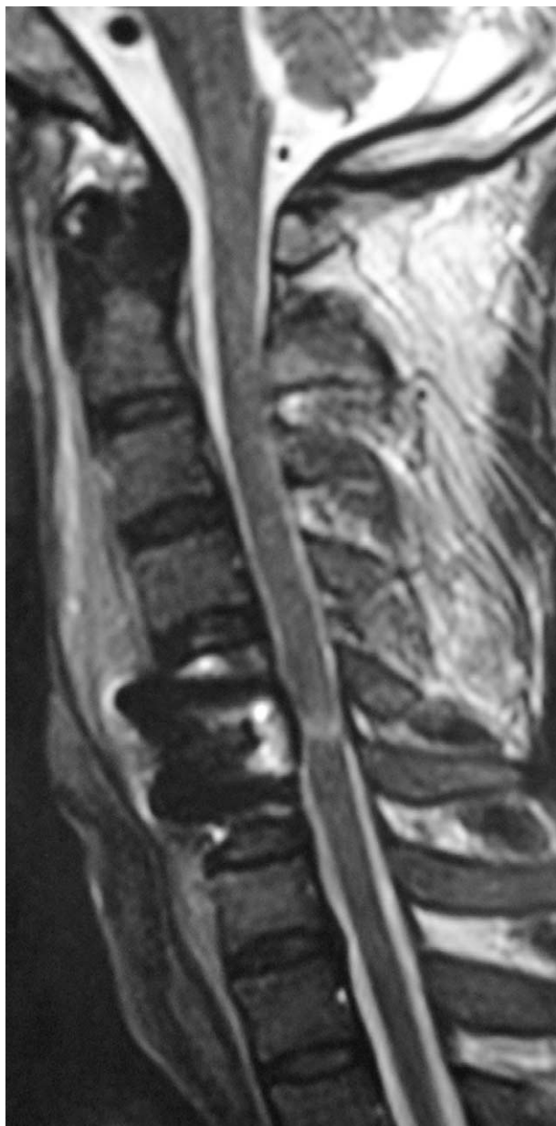
FIGURE 4. T2-weighted sagittal magnetic resonance imaging (MRI) 7 days after operation showed disappearance of cord compression at C5/6 disc level.

many etiologies and several mechanisms. 4,5 One previous study showed that vertigo was present in 50% of patients with cervical spondylosis, 6 whereas another study identified cervical spondylosis as the cause of dizziness in 65% of elderly patients. 7 It has been shown that the patients with cervical spondylosis complaining of vertigo have significant lower blood flow parameters than non-vertigo patients with cervical spondylosis. 4 Insufficient blood supply to posterior circulation is called vertebrobasilar insufficiency. The most common complaint in patients with vertebrobasilar insufficiency is vertigo. Insufficient blood supply does not necessarily cause symptoms if there is sufficient collateral circulation, whereas a full range of symptoms commonly occur as a result of an insufficient terminal vessel. 8,9 The vascular supply to the vestibulocochlear organ, being an end artery, makes this organ more susceptible to vertebrobasilar insufficiency. Neurons, axons, and hair cells in the vestibulocochlear system are known to respond to ischemia by depolarizing, causing transient hyperexcitability