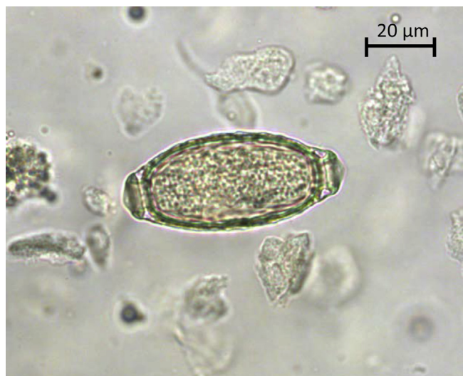
Fig. 1. A typical barrel-shaped Capillaria plica egg in urine sediment from a red fox. The egg show a slightly pitted shell and two opercules with polar plugs. (For interpretation of the references to colour in this figure legend, the reader is referred to the Web version of this article.)

open ( n = 586 ), washed with 10 ml milliQ water and the water collected in 15 ml plastic tubes. All samples were centrifuged ( 178 \times g ) for 10 min, the supernatant discarded to 1.5 ml, flotation fluid added to 3 ml, and samples screened for C. plica eggs (Fig. 1). The egg quantity per ml was recorded.