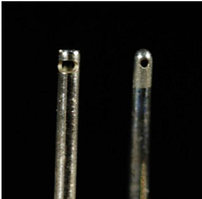
Fig. 4. Gross photograph comparing the size and shape of the aspiration ports of the 20-gauge vitrectomy probe (Alcon Laboratories, Inc.) and the 21-gauge aspiration handpiece (Katena Products, Inc., Denville, N.J., USA).