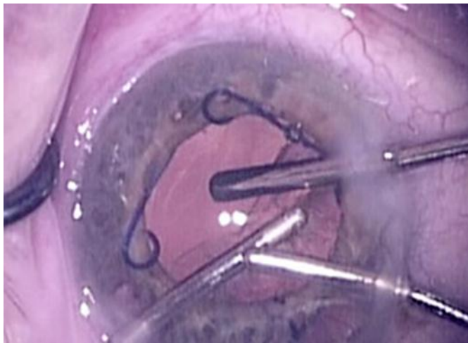
Fig. 2. Intraoperative photograph from the operating microscope (surgeon's view). The surgeon's left hand is aspirating cortex with the aspiration handpiece, and the right hand is holding the irrigation handpiece in the anterior chamber. Superiorly (right side of the photograph), the assistant is holding the vitrectomy probe with the tip posterior to the capsule defect.