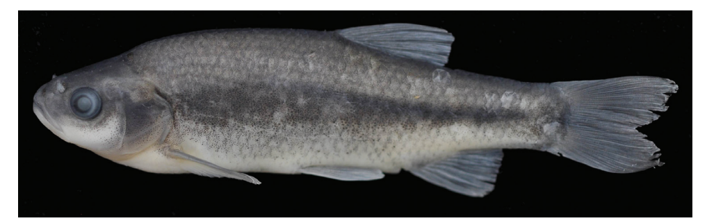
Figure 2. P. turani sp. n. holotype, IFC-ESUF 03-1002, 71.3 mm SL, Turkey: Hatay prov.: Hassa, Incesu Spring, Asi River drainage.

Description (See Figs 2, 3 for general appearance and Tables 1, 2 for morphometric and meristic data). Body deep, its depth at dorsal-fin origin 26–29% SL, mean 27.8, and laterally compressed. Dorsal profile markedly convex with marked hump at nape, ventral profile less convex than dorsal profile. Dorsal-fin origin situated behind base of pelvic-fin. Predorsal length 56–60% SL, mean 58.2 and prepelvic length 51–54% SL, mean 52.4. Head short, its length 26–28% SL, mean 26.9, approximately equal to or slightly shorter than body depth, upper profile straight or slightly convex on interorbital area and markedly convex on snout. Mouth terminal, with slightly marked chin, its corner not reaching vertical through anterior margin of eye. Eye small, its diameter 25–29% HL, mean 26.6. Snout somewhat long, with rounded tip, its length 27–31% HL,