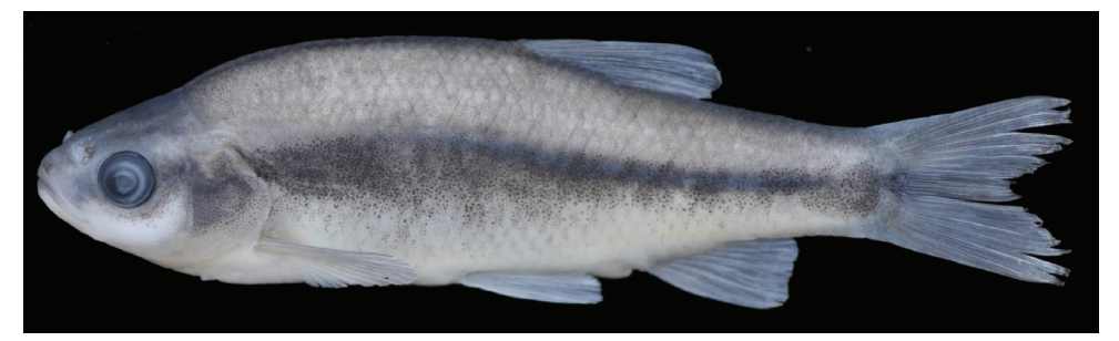
Figure 3. P. turani sp. n. paratype, IFC-ESUF 03-1003, 66.0 mm SL, Turkey: Hatay prov.: Hassa, İncesu Spring, Asi River drainage.

Table 1. Morphometry of P. turani sp. n. (holotype IFC-ESUF 03-1002, paratypes IFC-ESUF 03-1003, n=20) and P. kervillei (IFC-ESUF 03-0987, n=21).