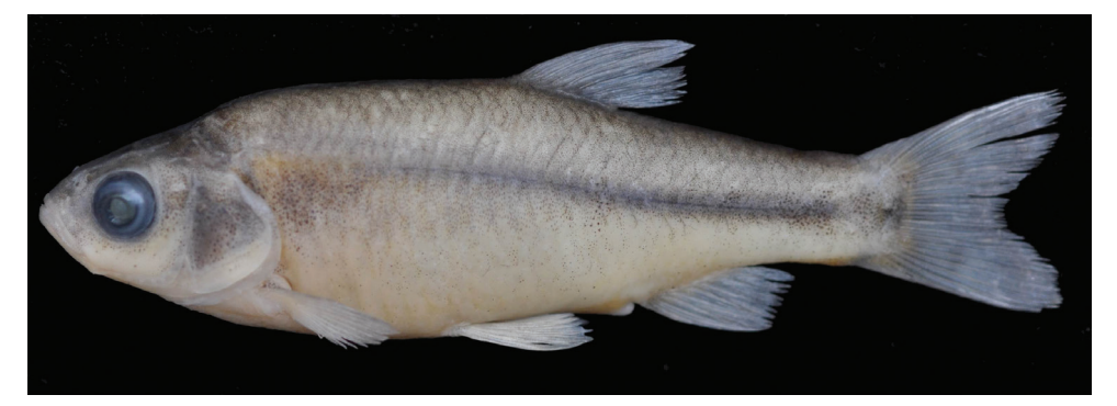
Figure 4. P. kervillei IFC-ESUF 03-0987, 73.2 mm SL, Turkey: Hatay prov.: Lake Gölbaşı, Asi River drainage.

Below we compare P. turani from the İncesu Spring, a drainage of Asi River, with the Eastern Mediterranean region Pseudophoxinus species group: P. kervillei from Gölbaşi Lake (Asi River drainage), P. zekayi from Aksu Stream (Ceyhan River drainage), P. zeregi from Sinnap Stream (Kuveik River drainage), and P. firati from Tohma Stream (Fırat River drainage) (Pellegrin 1911; 1928; Bogutskaya 1997; Bogutskaya et al. 2007). Pseudophoxinus turani is easily distinguished from P. kervillei by its terminal mouth (vs. slightly superior) and rounded snout (vs. slightly rounded). It is further distinguished from P. kervillei by having more gill rakers on the outer side of the first gill arch (8–11, rarely 13, vs.7–8), usually more lateral-line scales (12–25, vs. 4–17), more abdominal vertebrae (21–22, vs. 19–20), usually more total vertebrae (36–38, vs. 35–36) and sometimes fewer branched pelvic-fin rays (6 vs. 6–7). Besides the differences listed above P. turani has a smaller eye diameter and longer snout than P. kervillei .