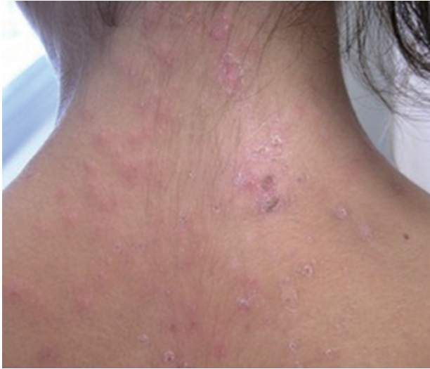
Fig. 1. Several isolated or confluent, roundish, erythematous papules, covered by scales, located on the nape, shoulders and upper portion of the back.