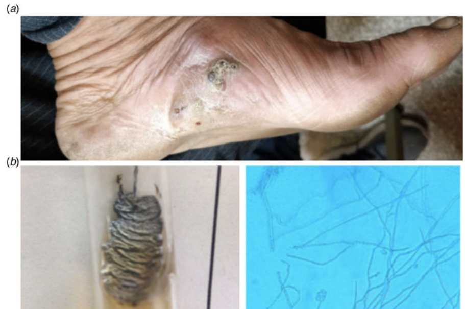
Fig. 1. (a) Granulomatous lesion with sinus tract formation and discharging black grains, tumefaction and (b) Colony morphology and microscopic picture of E. jeanselmei .