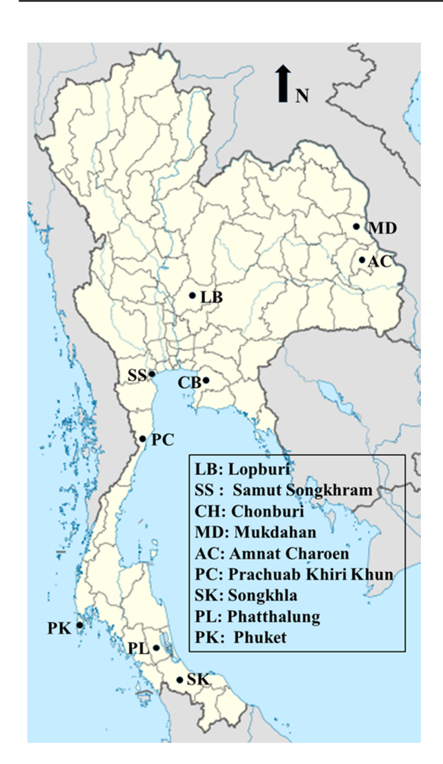
Figure 3. Map showing Thai provinces where blood samples from long-tailed macaques were collected (https://commons.wikimedia.org/wiki/File:Thailand_location_map.svg/, accessed on 11 March 2021).

Table 2. Location of sample collection and numbers of samples.