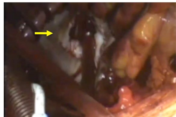
Figure 2 Intraoperative view of the mitral valve (arrow).

and suture technique was performed. A 26-mm Cosgrove-Edwards band (Edwards Lifesciences) was secured onto the posterior annulus for annuloplasty. The valve was verified competent under physiologic condition and a saline injection test was not necessary. The left atrium was closed using a standard technique. The tricuspid annuloplasty