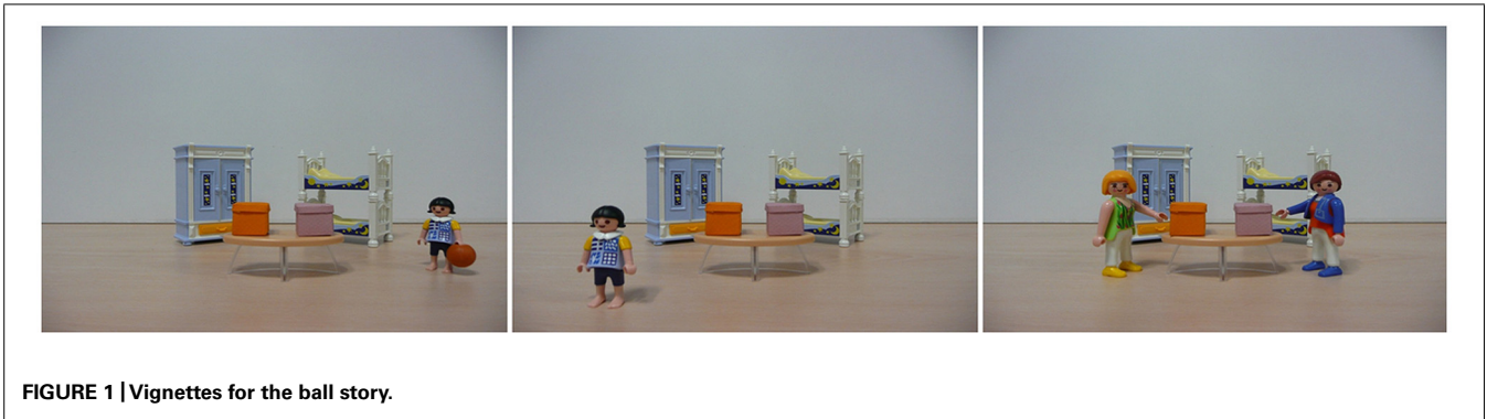
FIGURE 1 | Vignettes for the ball story.

The two other stories were built on the same model. In each of them, the young girl, the object carried, the colors of the boxes and their places (right/left), the two female informants, their names and their places (right/left), the two female informants, their names and their places (right/left) were varied. The child could obtain a maximum score of 3 points (1 point for each story when the box linked to the more fluent statement was chosen).