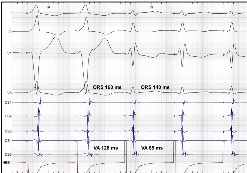
Figure 2 Para-Hisian pacing with increase in pacing output. The first 2 QRS complexes of left bundle branch block morphology result from pure right ventricular myocardial capture. Subsequent narrower QRS complexes of right bundle branch block morphology represent His bundle capture proximal to the site of block in the right bundle. Narrowing of the QRS complex with His bundle capture corresponds to shortening of the ventriculoatrial (VA) interval from 128 to 85 ms. CS1 to CS5 represent proximal to distal coronary sinus electrodes.

(Figure 1). Such a response to para-Hisian pacing is considered indicative of retrograde conduction via an AP. However, in the present case this was a variant of the nodal response.