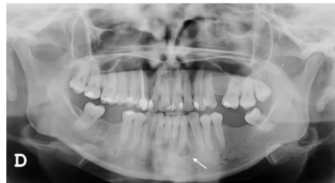
Figure 3 Panoramic radiograph showing radiolucency around the root of the mandibular left lateral incisor (arrow).

ing lesion in variable location depending on the affected teeth. 2 The sinuses are more commonly associated with the infection of the mandibular teeth rather than the maxillary teeth, which will normally drain to the chin and jaw. Given these many different presentations and locations, OCF is often misdiagnosed, leading to inappropriate dermatological treatment and unnecessary antimicrobial therapy. Differential diagnosis includes subcutaneous mycosis, actinomycosis, osteomyelitis, neoplastic processes such as basal cell carcinoma or squamous cell carcinoma, epidermal cysts, and pyogenic and foreign body granulomas. 1