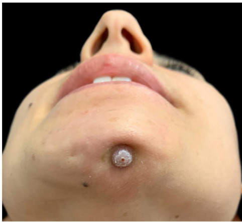
Figure 1 Erythematous nodule with surrounding retraction on the chin.

A 27-year-old female patient presented with a six-month history of a persistent and painful nodule on the chin. She referred occasional purulent exudate. There was no history of fever or systemic symptoms. Several courses of oral antibiotics had been ineffective. In the extraoral examination she presented an erythematous nodule with an important surrounding retraction (Fig. 1). Ultrasonography (Esaote MyLab Gamma®, 18 MHz) revealed a hypoechoic